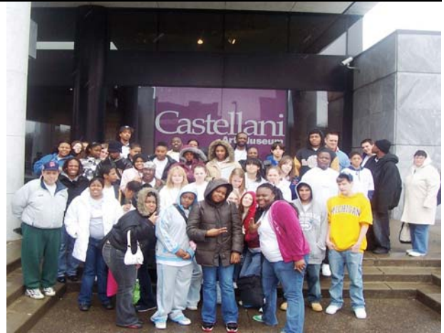
cIcu GEAR UP College Quest 2007 at Niagara University